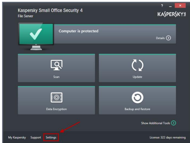
From kaspersky.com website

It is the only IT security solution that's specifically designed for smaller businesses and combines award-winning anti-malware plus special technologies that protect more of the things that matter to you. Everything is administered through a web-based dashboard so that you, or anyone else you choose, can manage your IT security remotely through the internet.